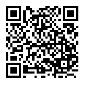
DOI: dx.doi.org/10.17504/protocol s.io.rm7vzxx9rgx1/v4

Protocol Citation: Tyler Stahl 2023. Bulk RNASeq Delivery. protocols.io https://dx.doi.org/10.17504/p rotocols.io.rm7vzxx9rgx1/v4V ersion created by Tyler Stahl