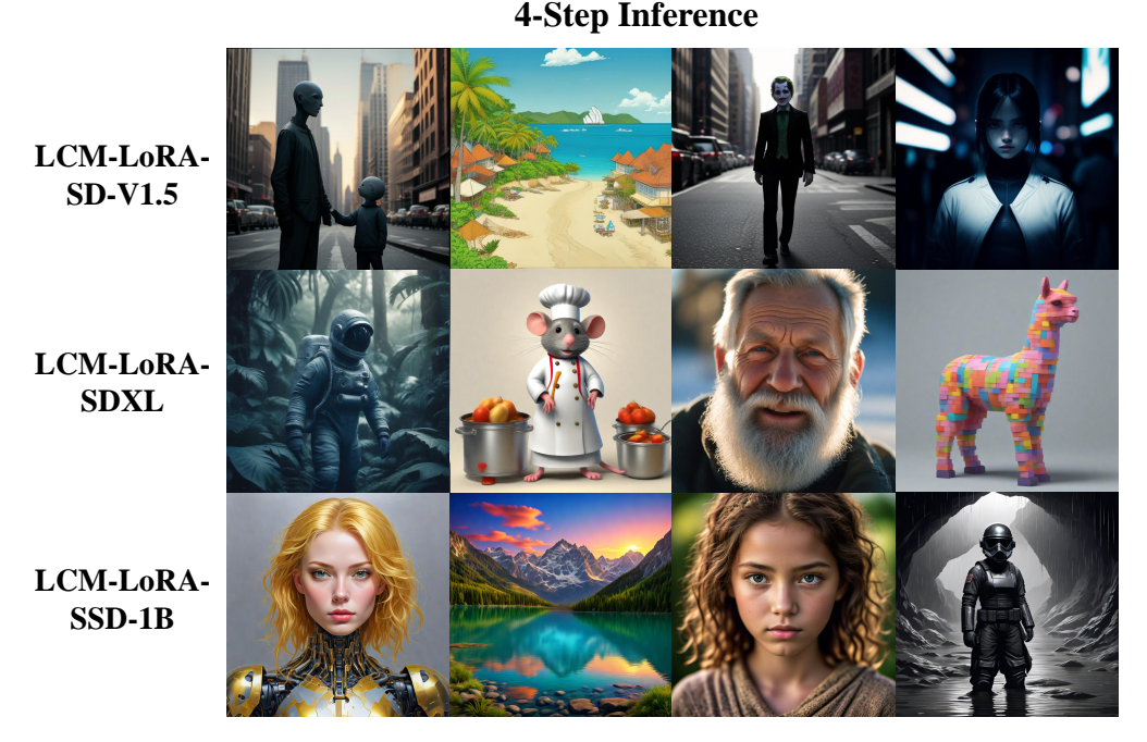
Figure 2: Images generated using latent consistency models distilled from different pretrained diffusion models. We use a fixed classifier-free guidance scale \omega = 8.0 for all models during the distillation process. All images were obtained by 4-step sampling.

model with the trainable parameters when using the LoRA technique. It is evident that by incorporating the LoRA technique during the LCM distillation process, the quantity of trainable parameters is significantly reduced, effectively decreasing the memory requirements for training.