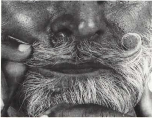
Fig. 1. A single, erythematous, shiny, succulent, noduloplaque lesion over the right nasolabial fold and area below right nostril.